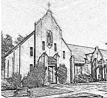
St. Joseph Church, Blackwell Office Hours-MWF 10am-12pm (580)-363-0441 stjosephblackwellokc@gmail.com

Acts 2:14, 22-33; 1 Peter 1:17-21; Lk 24:13-35