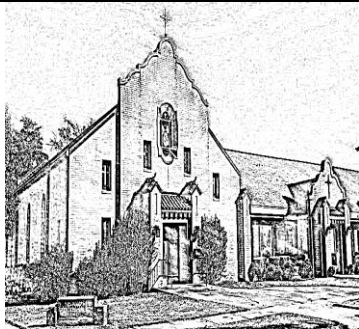
St. Joseph Church, Blackwell Office Hours-MWF 10am-12pm (580)-363-0441 stjosephblackwellokc@gmail.com

Blackwell: On Saturdays at 4:30 pm or any time by appointment.