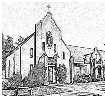
St. Joseph Church, Blackwell Office Hours-MWF 10am-12pm (580)-363-0441 stjosephblackwelloc@gmail.com

Zeph. 2:3; 3:12-13; 1 Cor 1:26-31, 17; Mt 5:1-12