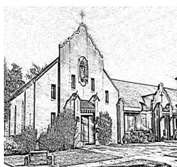
St. Joseph Church, Blackwell Office Hours-MWF 10am-12pm (580)-363-0441 stjosephblackwelloc@gmail.com

Is 40:1-5, 9-11 • Ti 62:1-5 • Lk 3:15-16, 21-22