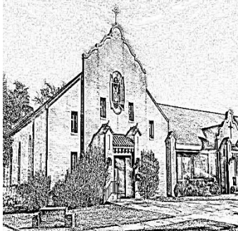
St. Joseph Church, Blackwell Office Hours-MWF 10am-12pm (580)-363-0441 stjosephblackwellokc@gmail.com

CONFESSIONS Blackwell: On Saturdays at 4:30 pm or any time by appointment. Tonkawa: On Sundays 15-20 minutes before Mass or after. ADORATION Blackwell: Weekly on Thursdays 9:00 am – 10:30 am. Tonkawa: Weekly on Tuesdays 8:30-9:30 am. ROSARY 25 Minutes before all the Masses.