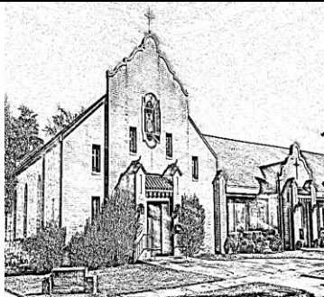
St. Joseph Church, Blackwell Office Hours-MWF 10am-12pm (580)-363-0441 stjosephblackwellokc@gmail.com

Blackwell: On Saturdays at 4:30 pm or any time by appointment.