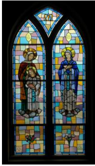
ST. ANNE (left)