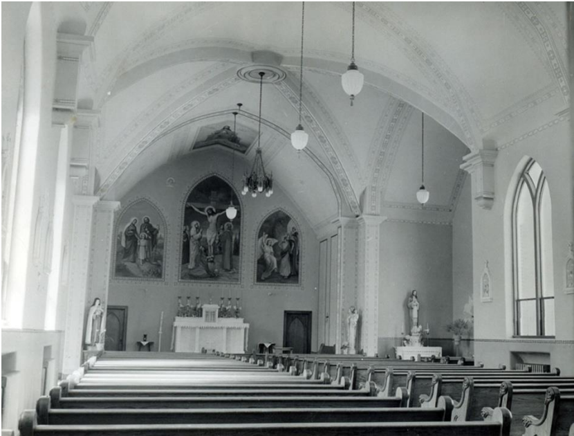
Church interior circa early 1950s. Note steam radiator under window at right.

The two-story rectory became St. Joseph's Mission House from which four priests conducted missionary work, and the parish in Blackwell was for a time a mission of Tonkawa. Since Blackwell and Tonkawa parishes are now served by one priest, the building presently houses a chapel, Religious Education classrooms, the Religious Education Director's office, and an office and small apartment for the pastor's use.