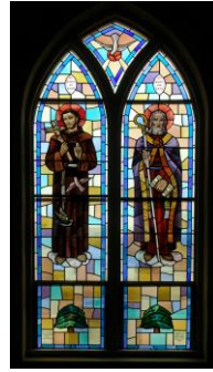
ST. FRANCIS OF ASSISI (left)