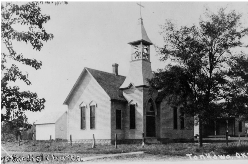
The first Catholic Church in Tonkawa at the corner of Grand Avenue and Tenth Street. The building was purchased from the Methodist Church.