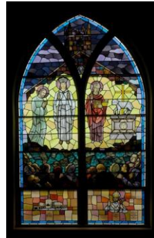
APPARITION OF OUR LADY AT KNOCK