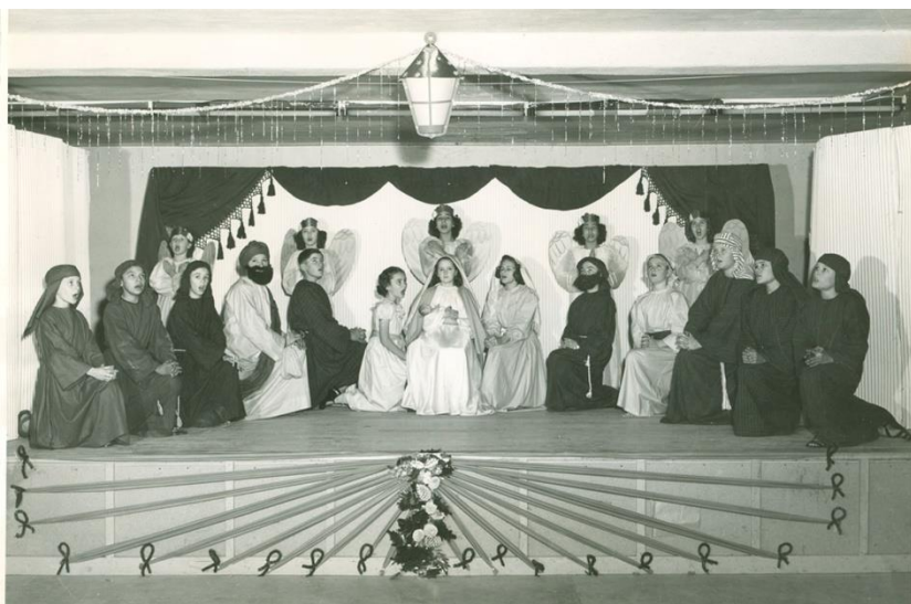
Christmas pageant on the Parish Hall stage circa 1950. The stage area is now a small room used for meetings, religious education classes, and intimate social events,