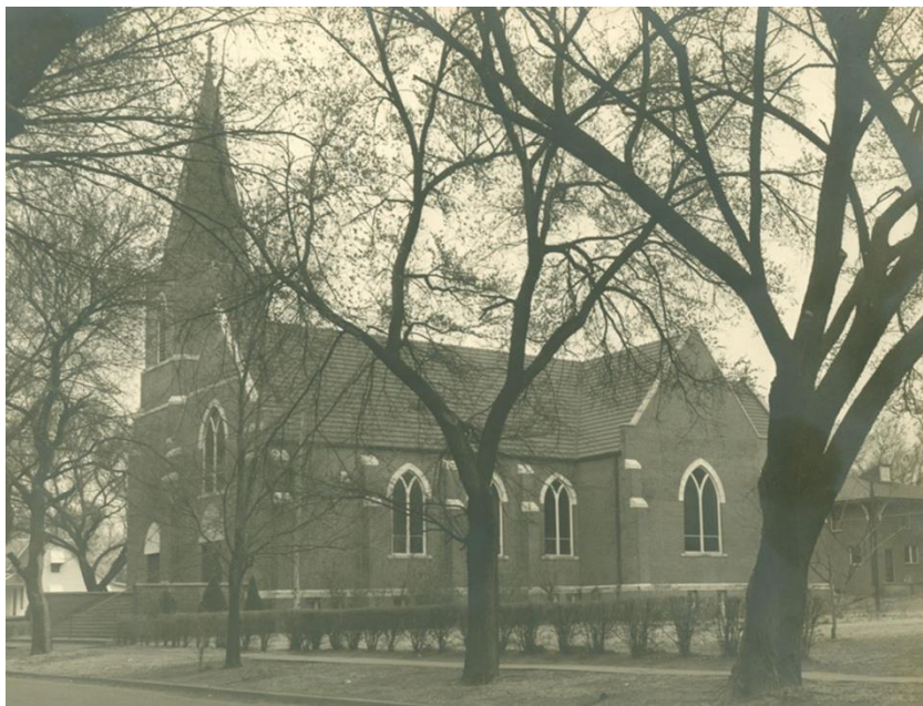
The present St. Joseph Catholic Church, looking from the north, circa early 1950s.