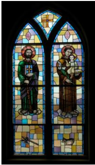
ST. JUDE (left)