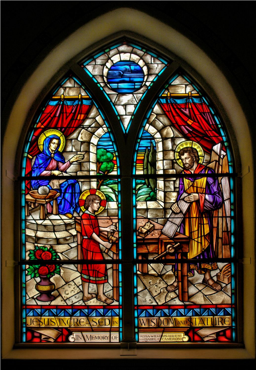
Jesus Increased in Wisdom and Stature