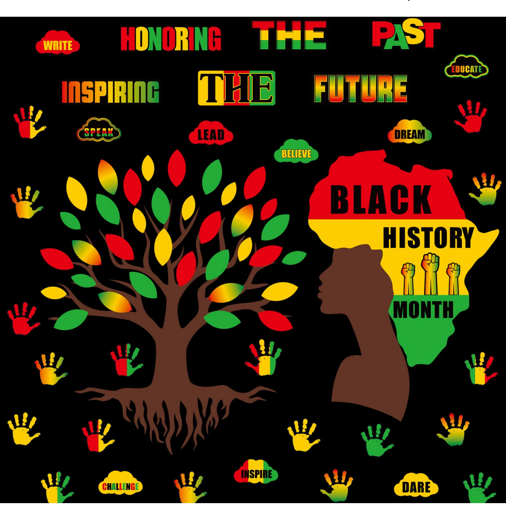
Give light and people will find the way - Ella Baker