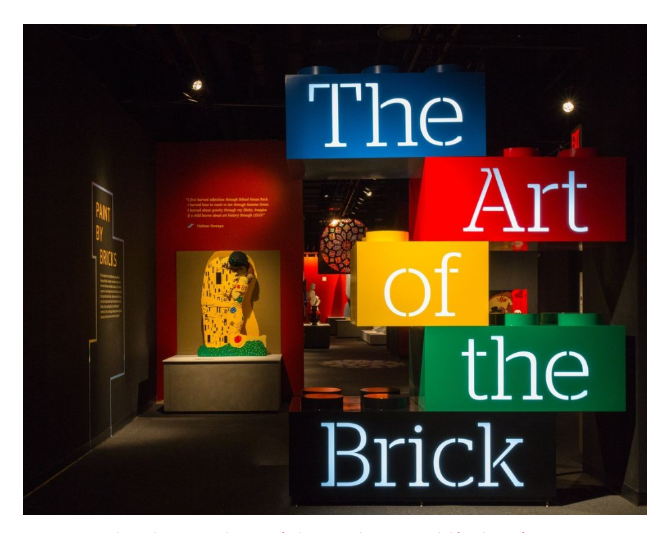
The Art of the Brick at The Franklin Institute