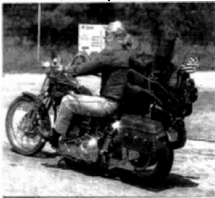
WAYNE "HEART ATTACK" CARAWAN

IT'S NOT THE DESTINATION, IT'S THE JOURNEY.