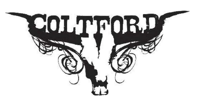
Colt Ford March 9th at 8pm