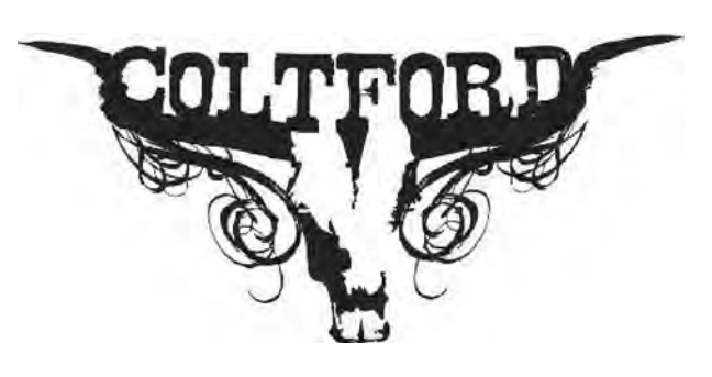
Colt Ford March 9th at 8pm