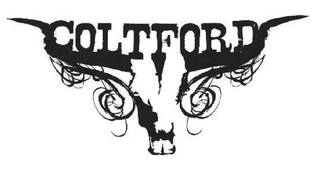
Colt Ford March 9th at 8pm