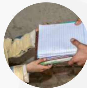
Distribution of books to school kids