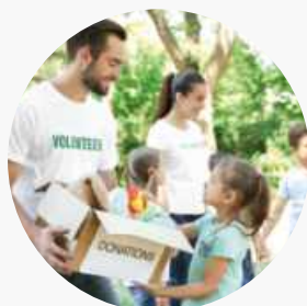
Donations to orphanages