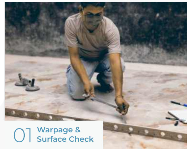
01 Warpage & Surface Check

We have the most modern and advanced infrastructure to support its high-quality tile manufacturing. Right from state-of-the-art machinery to technologically advanced quality control processes, Italica has it all. For us, quality control of our products remains our top priority, which is why regular and in-depth quality checks are made of every batch leaving the production line. We use modern machines and technologies to perform the following checks.