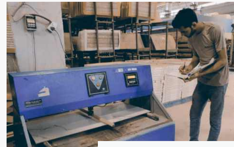
04 Tile Breaking Strength Check (MOR)