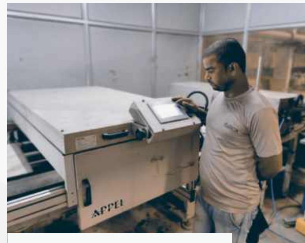
02 Italian High Precision Shorting Machine