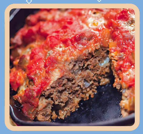
Servings: 8 Serving Size: 1/8 Loaf