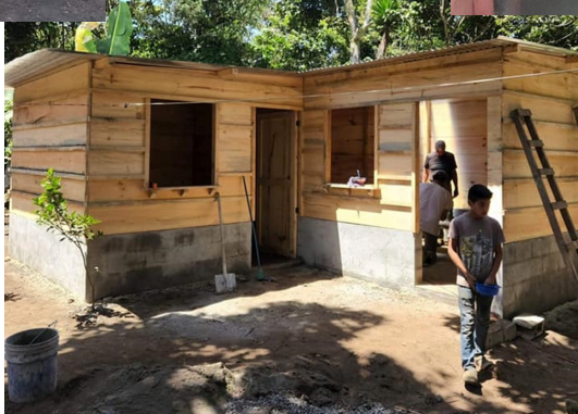
One of our recent AKALA homes that was made thanks to our donors!

The blue pila is a great addition to this new house. The pila is used for washing dishes, clothes, children and many other daily tasks