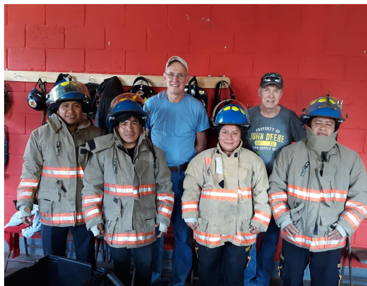
Fire Department with donated helmets, coats and pants from Minnesota