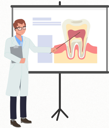
Objective Structured Clinical Exam