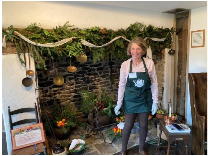
Decorating the Half Moon Inn