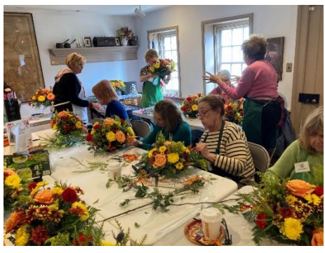
November Flower Class