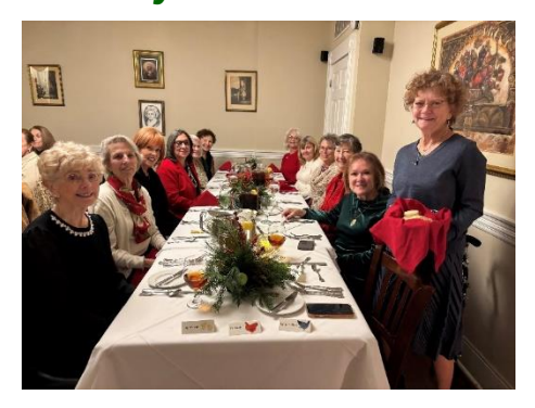
Holiday Luncheon & New Officer Installation