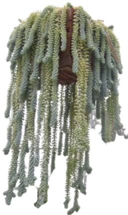
Burro's Tail in bloom

Also interesting is the Burro’s Tail. (Sedum morganianum). Its long stems are layered with silvery teardrop-shaped leaves, and is long-lived.