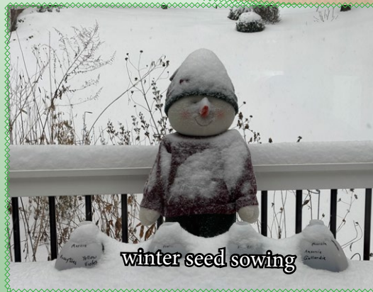
winter seed sowing