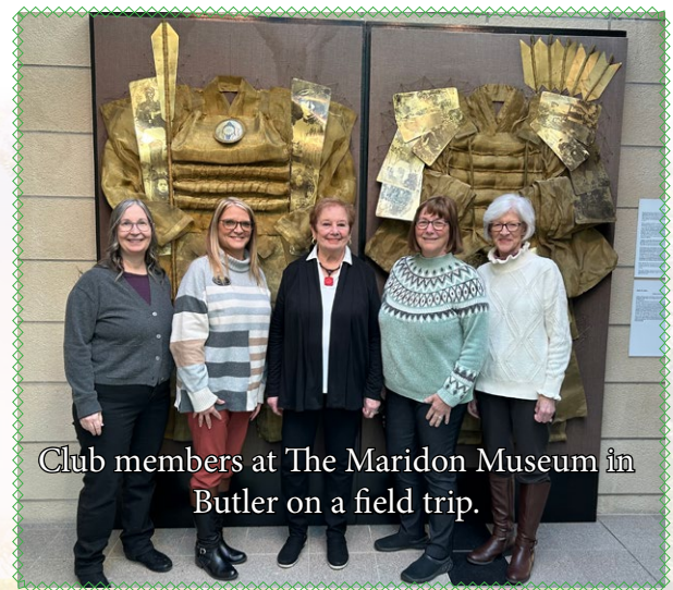
Club members at The Maridon Museum in Butler on a field trip.