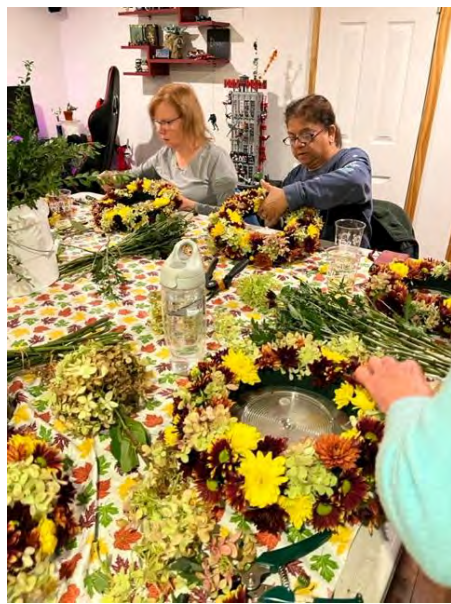
Members working on their arrangements