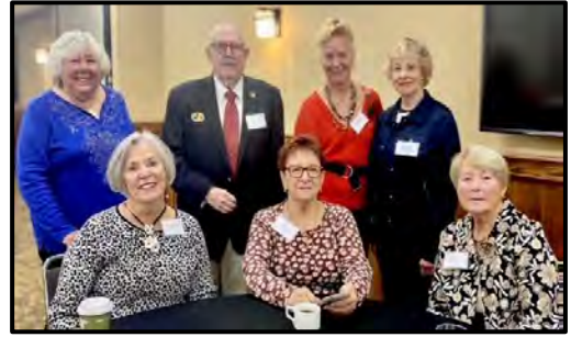
Container and Indoor Gardening