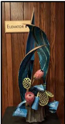
National Capital Area – Lotus