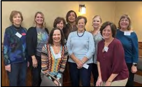
From National Capital Area