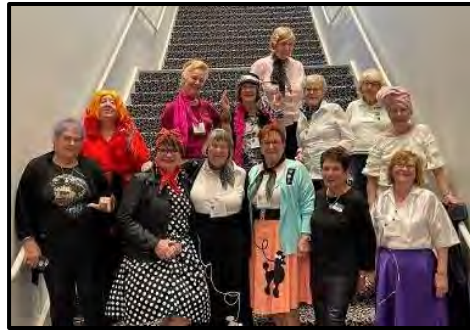
GCFP Board Members Dressed for Rock 'n' Roll Flower Show