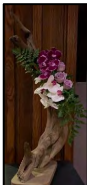
Ohio – Orchid