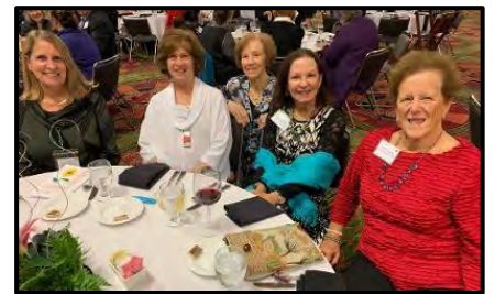
From National Capital Area