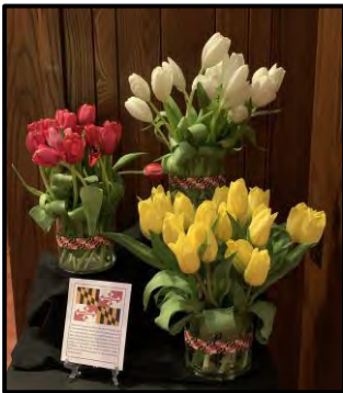
Maryland - Tulip