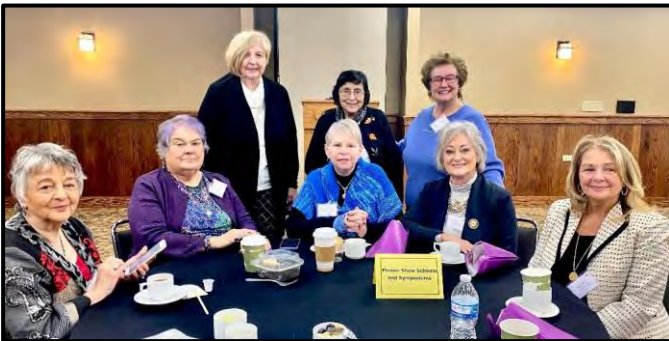
Flower Show Schools