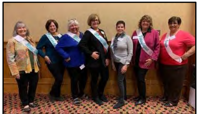
CAR-SGC Presidents at the November Conference