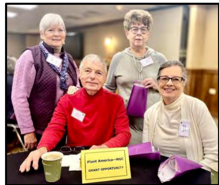
Plant America – NGC Grant Opportunity