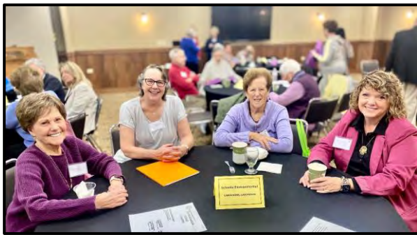
Schools Environmental, Gardening, Landscape