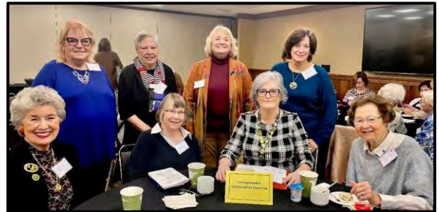
Environmental Conservation Concerns