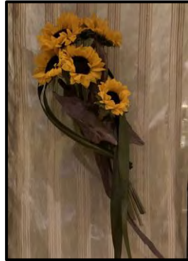
Sunflower – New York