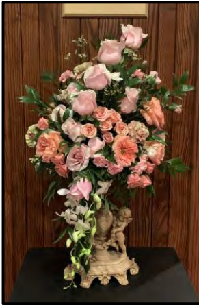
Delaware - Rose