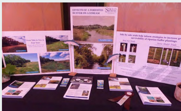
COUNTRY GARDENERS, NGC Educational Award