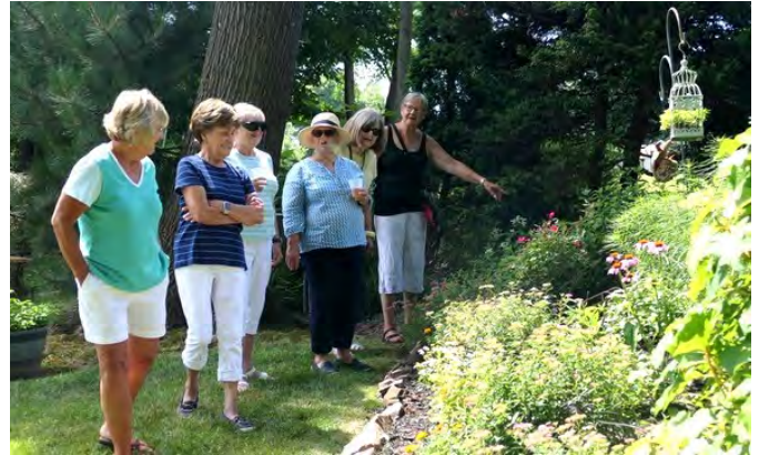
Members enjoying a pop-up-garden tour

The annual Christmas fair raised over $10,000 and over 75% of their members contributed in some way. They sold over 50 wreaths, 100 plus indoor and outdoor arrangements, jams, jellies, baked goods, a sleigh, decorated skis and skates and also had a raffle.