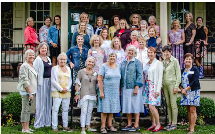
S & T Members at the Installation of Officers Luncheon