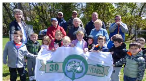
Spring Arbor Day Activities

The club maintains three community gardens and participates annually in the Arbor Day activities, which includes the donation of and planting of a tree. They decorated a window of the township library to increase club visibility.