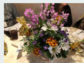
Centerpieces designed and donated by each club