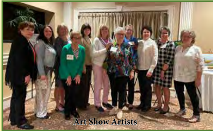
Art Show Artists