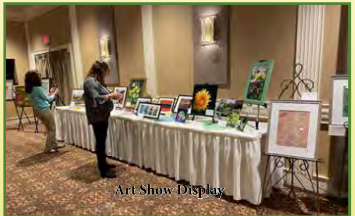
Art Show Display