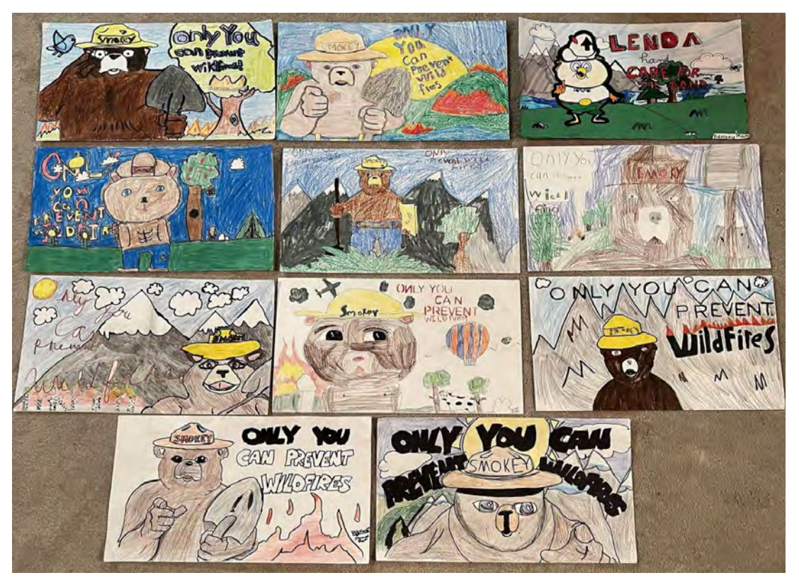
Local Troy, PA school kids produced these wonderful posters for the Penny Pines effort. Each young artist was thanked with a gift certificate of $5.