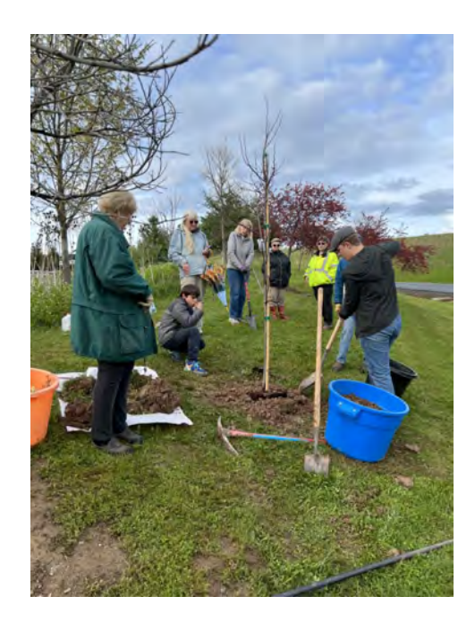
Arbor Day tree planting of a redbud, with HGC members and members of Boy Scout Troop 4049.