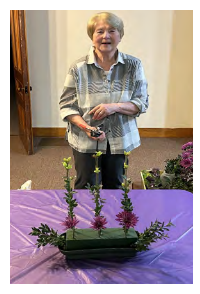
Vertical design by Sharon Brown

Heritage GC design gurus show what they can do.