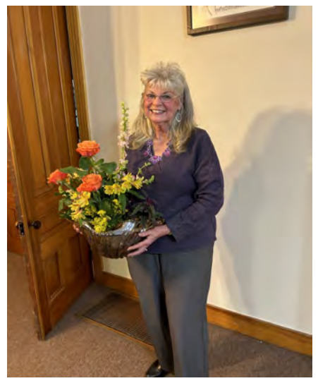
Pot de fleurs by Barb Andrus

Heritage GC design gurus show what they can do.