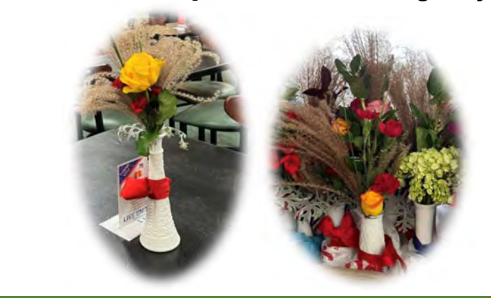
Evergreen Garden Club's "Tinsel Time"

Arrangements created by the Evergreen Garden Club for the United Way Pancake and Sausage Day.