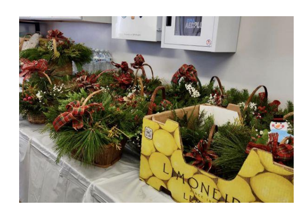
Holiday Baskets for Markley Residents