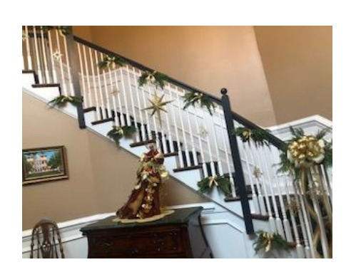
Holiday House Tour