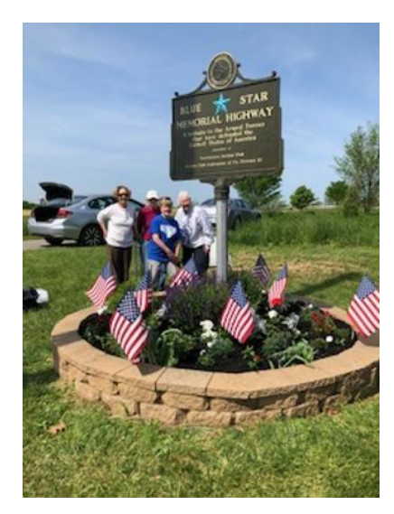
Hospital was built. This is the refurbished one. Our club is responsible for maintenance of the Marker, the Farm Park Staff mow around the marker. We plant seasonally and weed as needed.

District XI sponsored and paid for one in the Garden of Reflection in the 9/11 Memorial Park 1950 Woodside Road, Yardley. Dedicated on November 10, 2010. This is a Blue Star Marker. I was unable to find a photo of it.