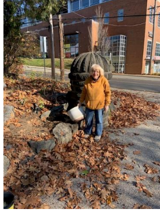
Planting bulbs for spring bloom