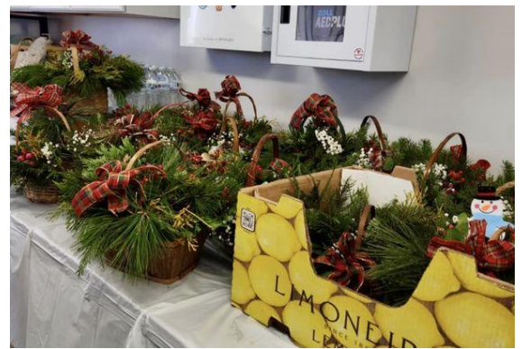
Holiday Baskets for Markley Residents