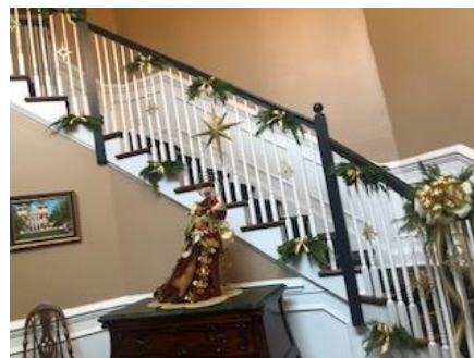
Holiday House Tour