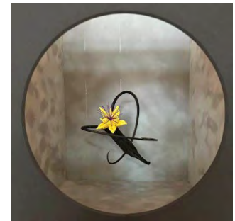
Sue Bunkin -Four Lanes End G C