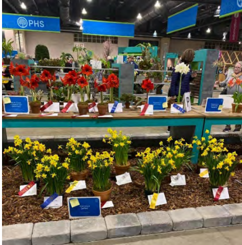
Bristol Borough G C Forced Bulbs