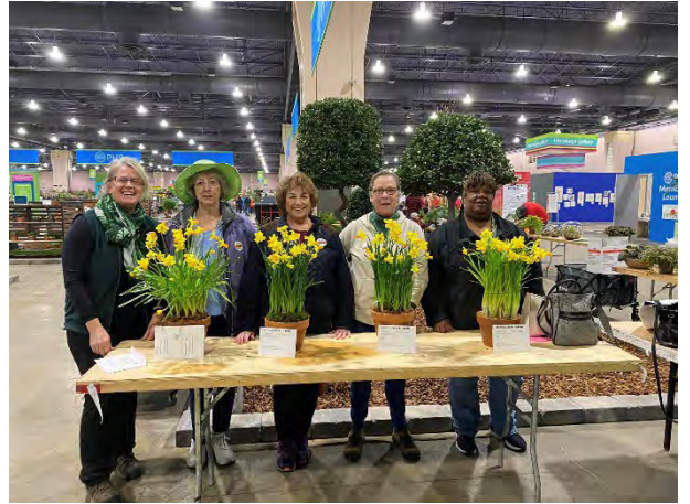
Bristol Borough G C at Philadelphia Flower Show