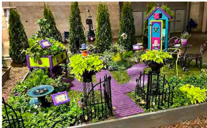
Norristown Garden Club Garden Room Blue Ribbon Entry