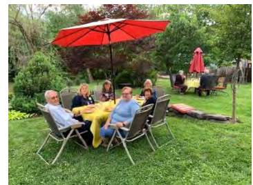
Garden Party after Tour!