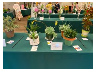
Stay tuned for “North to Alaska” Flower Show: August 12, (4-8PM), August 13, (10AM -4:30PM)