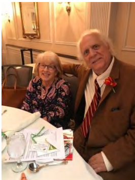
Seed Money Chair with Owner of Burpee Seed Co.