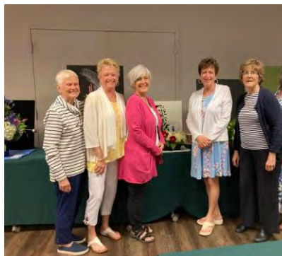
Hostesses for "Color Between the Lines"