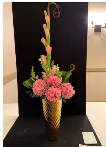
Many examples of Design.