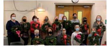
Valentine wreath making workshop & Garden Tour.