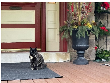
Working on Holiday Decorations