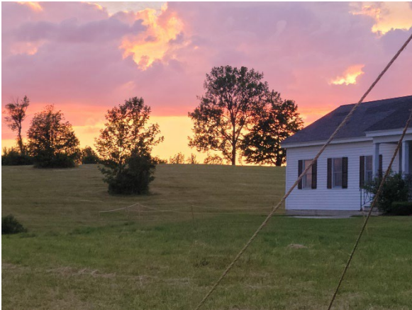
Sunset Monument hill