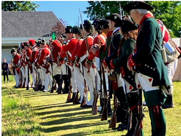
Pushing them off the field