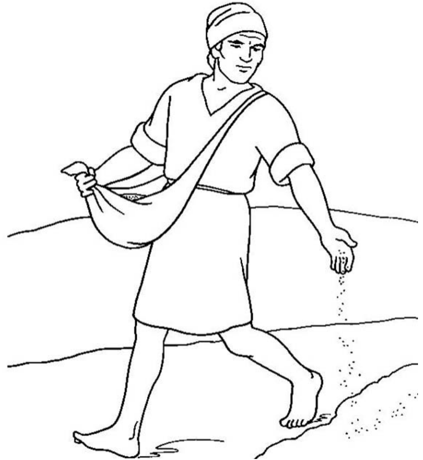
The Parable of the Seed Mark 4:26-29

Color the picture of the worker planting the seed.