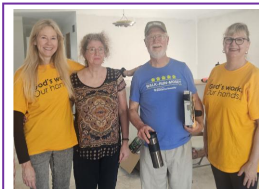
Social Ministry Habitat for Humanity Luncheon June 2025