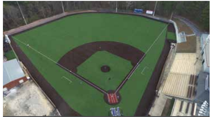
VESTAVIA HILLS HIGH SCHOOL Vestavia Hills, AL

Product: TruHop SQFT: 129,822 Year: 2017