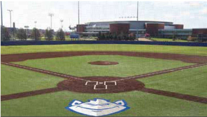
ST. LOUIS UNIVERSITY St. Louis, MO