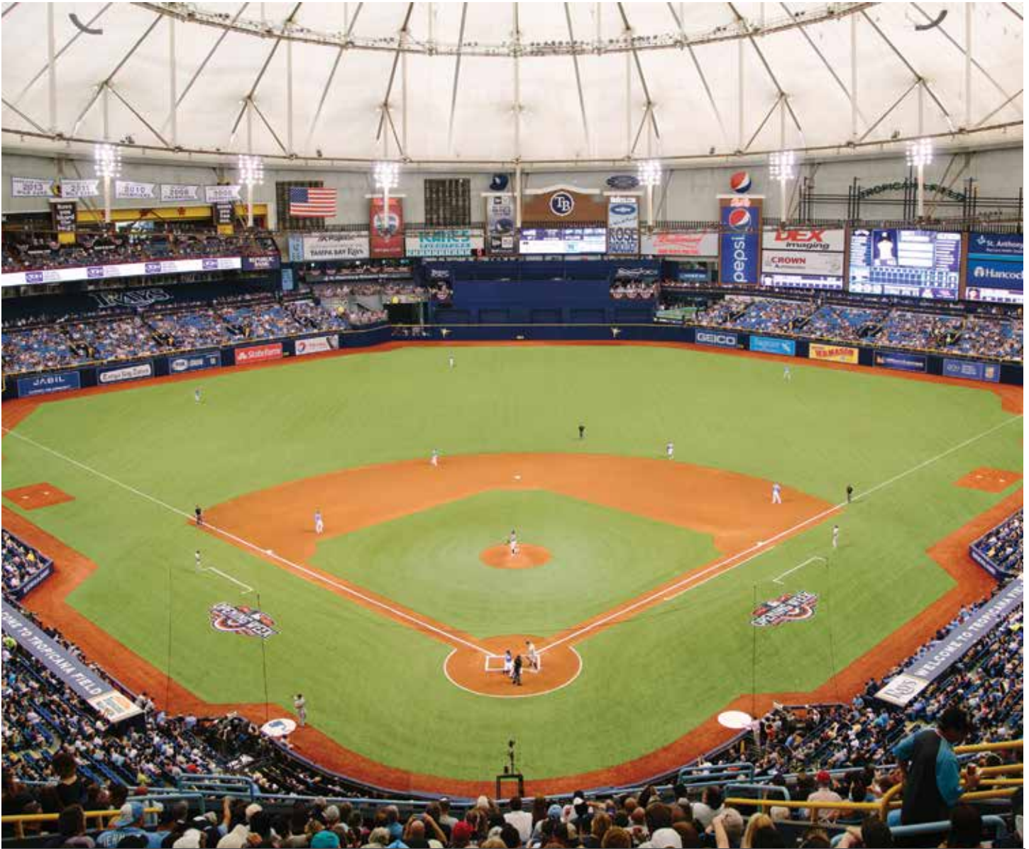
TAMPA BAY RAYS TROPICANA FIELD St. Petersburg, FL Product: TruHop Triple Crown SQFT: 143,370 Year: 2017

THE TAMPA BAY RAYS are one of two teams in Major League Baseball to play on synthetic turf. For them, the performance of the field was the key factor in deciding on a system to replace their old turf.