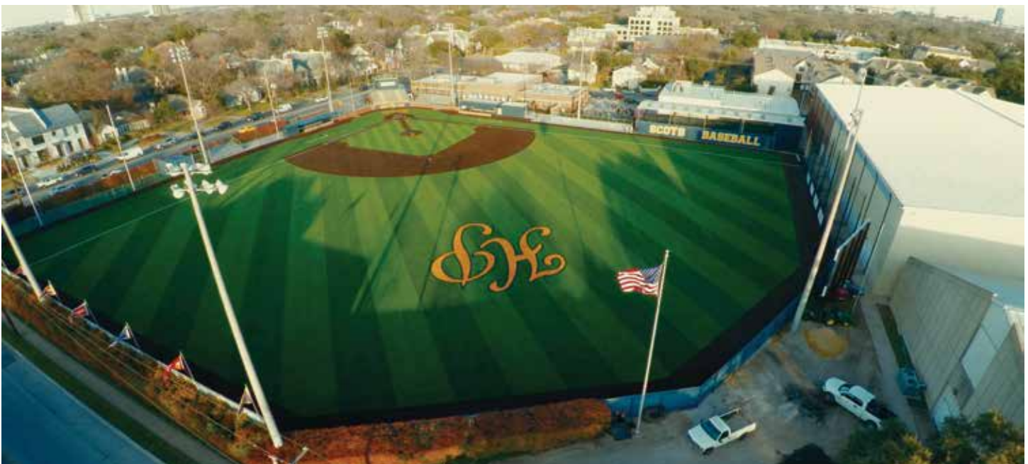
HIGHLAND PARK ISD Dallas, TX

Product: Fields 41 SQFT: 97,514 Year: 2017