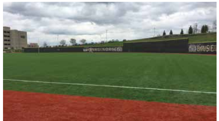
NORTHERN KENTUCKY UNIVERSITY Highland Heights, KY

Product: Spike Zone Pro SQFT: 160,968 Year: 2016