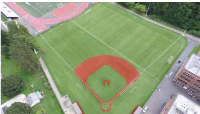
BOLIVAR-RICHBURG HIGH SCHOOL Bolivar, NY

Product: TruHop SQFT: 129,822 Year: 2017