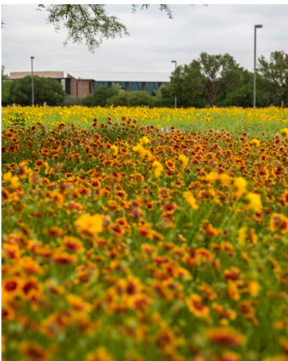
Xeriscaping at BNSF Railway HQ Campus

Green-Grey Hybrids: In hybrid approaches, NBS is combined with grey infrastructure to maximize the benefits of both approaches. Hybrid infrastructure has been studied extensively in the context of coastal resilience where, for example, sea walls may be combined with oyster reefs to protect against erosion and flooding. 12