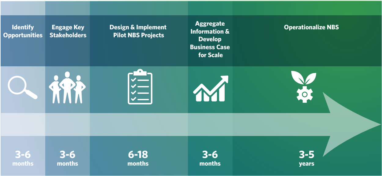
Figure 3 Estimated Timeline for NBS Operationalization. Recommended steps and timeframes for operationalizing NBS within a company.

In the final step, NBS is operationalized throughout the company . Ultimately, this step involves embedding NBS into all relevant business decisions and adopting a business decision-making process that considers the full suite of benefits of NBS, which typically have more ancillary benefits than business-as-usual grey alternatives. Operationalizing NBS takes time. Unlike the four preceding steps, this step may take years for a company to complete or may be a part of a decade-long company journey. Companies can create waves of success around operationalizing NBS by creating both short- and long-term goals that highlight more frequent achievements. It’s important to recognize that fully operationalizing NBS may be beyond the scope of the company as it may require regulatory changes and/or scientific advances that will need to be made by external partners. Companies should focus on driving change within the areas where they can make tangible progress. Key stakeholders to engage with in this process include communications, who can convey a company’s success internally and externally, and external partners, who can collaborate with the company to overcome broader barriers to NBS adoption.