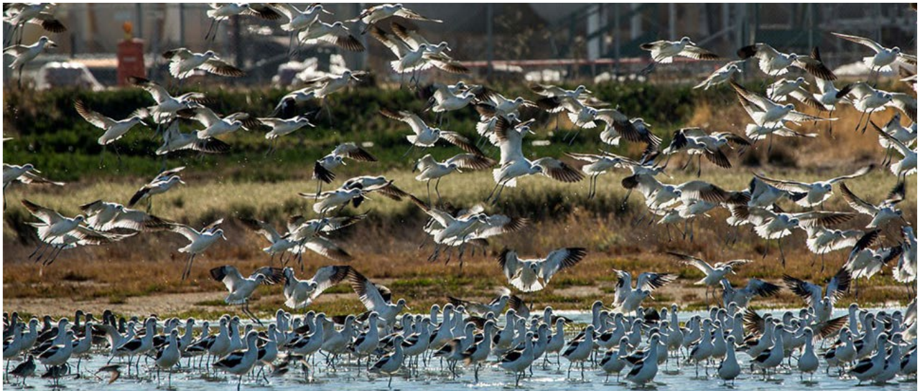
Richmond Water Enhancement Wetland