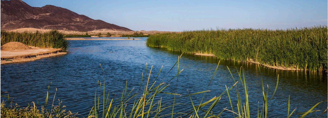
Constructed Wetland