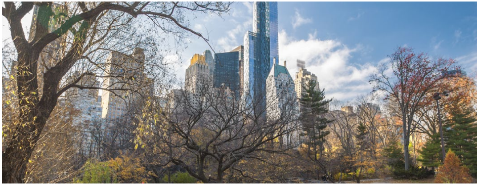
New York City Manhattan Central Park