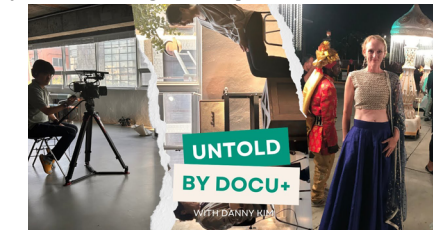
UNTOLD BY DOCU+