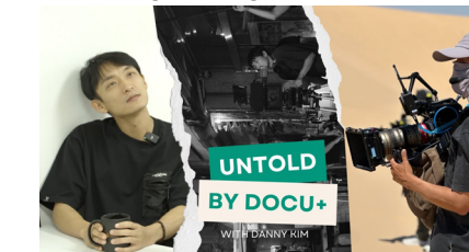
UNTOLD BY DOCU+

Untold brings hidden stories to light, uncovering untold histories, cultures, and human truths along with forgotten heroes and intriguing mysteries waiting to be explored.