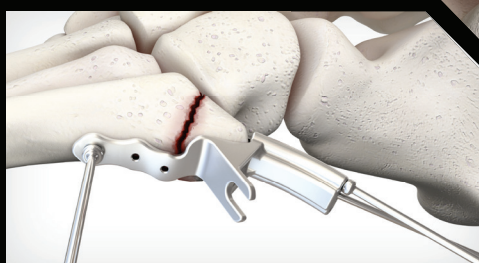
REDUCTION AND PLATE ALIGNMENT

INTELLIGENTLY DESIGNED GUIDED BY INNOVATION.