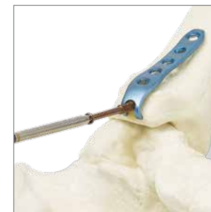
Ultra-low profile malleolar screw – Designed specifically for medial malleolar fracture fixation with the hook plate or as a standalone screw to minimize screw head prominence and soft tissue irritation. Available in 40 mm, 45 mm and 50 mm length options.