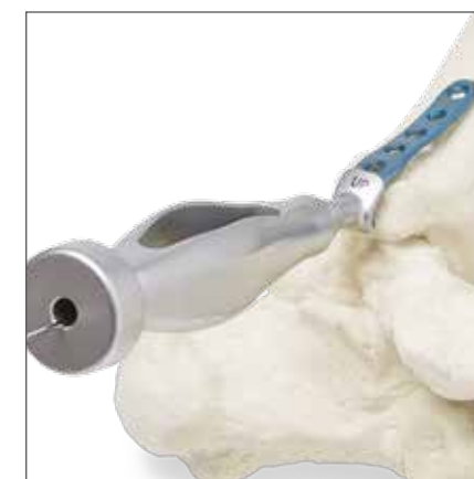
Impactor – Robust, cannulated instrumentation fits over an in-situ guidewire, allowing the surgeon to impact the hook plate prior to placing the optional hook plate screw.