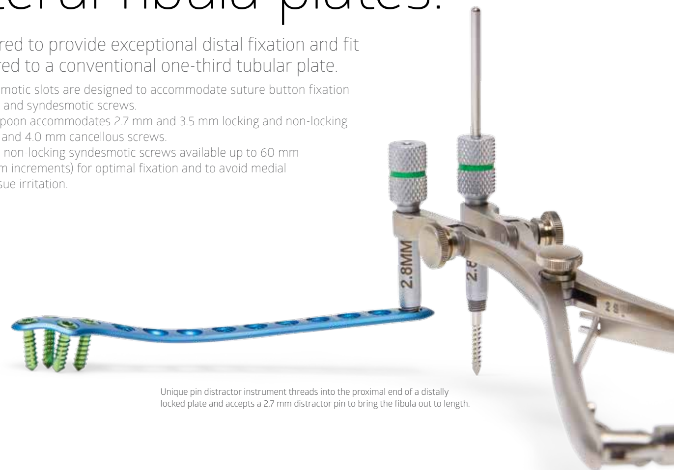
Unique pin distractor instrument threads into the proximal end of a distally locked plate and accepts a 2.7 mm distractor pin to bring the fibula out to length.