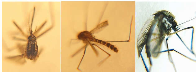
Left: Oc. trivittatus ; Center: Our gynandromorph, a Cx. salinarius with female head and male tail; Right: Ps. mathesoni

Our interesting collections began in June with an Ochlerotatus trivittatus . We have found a few of these in the past, but the last one was over 8 years ago, so she definitely would be considered a rarity for us. The next, and definitely most interesting, was finding our first gynandromorph. This was truly an exciting time! We had two other interesting catches, our first Psorophora mathesoni and three Oc. hendersoni . It's always a treat to spot species you don't usually see - it keeps you on your toes and makes slogging through thousands and thousands of mosquitoes much more interesting.