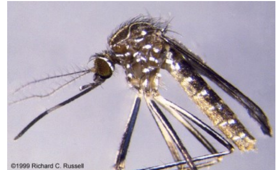
Aedes notoscriptus .

THAT is one of the mosquitoes recently reported to be on the move. It is an Aedes notoscriptus . Normally found in Australia, Ae. notoscriptus was discovered in Los Angeles County, California, this summer. This mosquito has a scutal pattern easily confused with Aedes aegypti , but Ae. notoscriptus has a pale band of scales on its proboscis. In Australia, it is an important vector of dog heartworm and several arboviruses. More details may be found on ProMed .