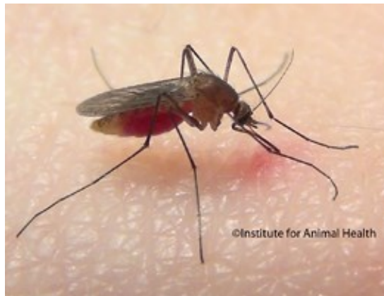
Culex modestus .

Yet another mosquito that has been expanding its range is the European West Nile virus vector Culex modestus . Last seen in the Kent region of England in 1945, Cx. modestus was collected from the area in 2010, and seems to be slowly spreading in that area. A 2012 paper in Parasites and Vectors describes the collections.