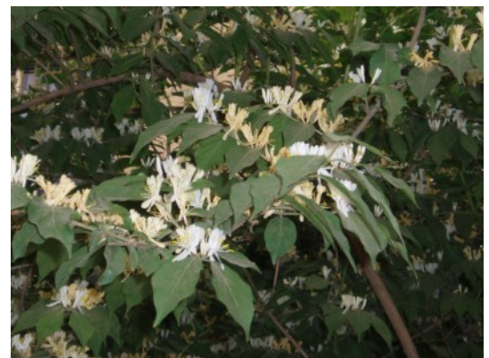
Lonicera maackii .

While Cx. modestus is common in central and southern Europe, it had never been collected in Denmark, until this summer. During August, residents of a suburb of Copenhagen reported frequent bites by this mosquito, which can also vector Usutu virus (another Flavivirus ), and has been implicated in others.