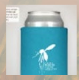
Blue can coolie with mosquito silhouette