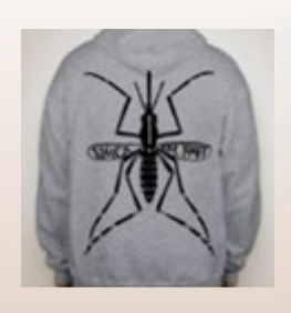
Gray Aedes albopictus pullover hoodie