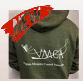
2018 VMCA pullover hoodie with flying mosquito design