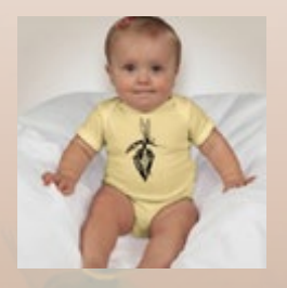
2017 MAMCA/ VMCA yellow onesie