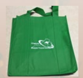
Green reusable tote bag with VMCA logo