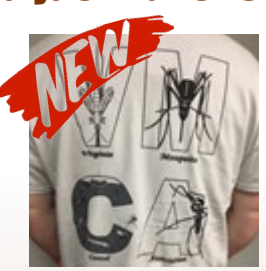
2018 VMCA lettered t-shirt design