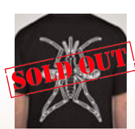
Black t-shirt with Aedes albopictus design