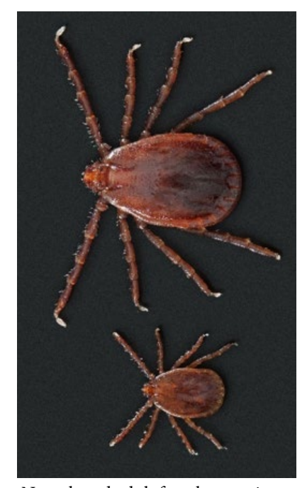
Nymph and adult female, top view