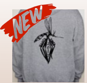
Gray zip-up hoodie with 2018 MAMCA/ VMCA design