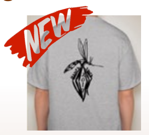
Gray t-shirt with 2018 MAMCA/ VMCA design