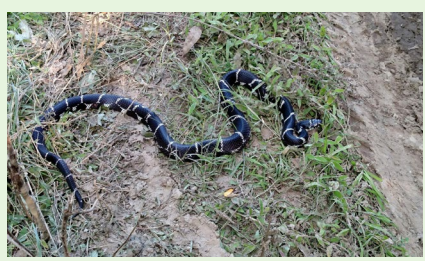
Eastern king snake found near a trap: Tim DuBois