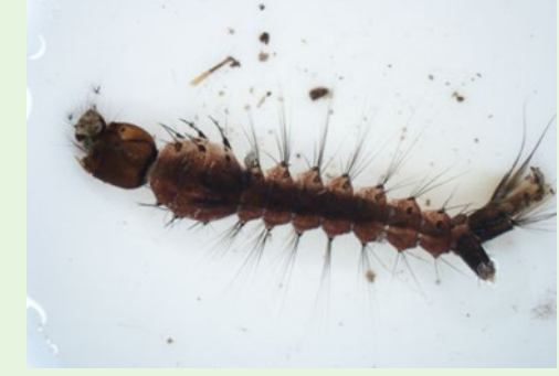
Efficiently pooping while consuming