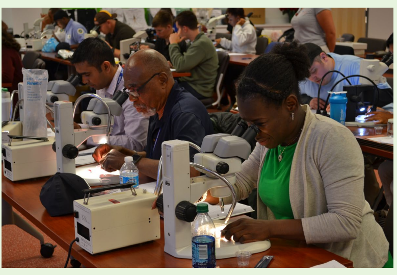
Students (Norfolk staff) identifying mosquito specimens.