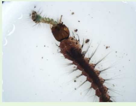
Right in the saddle!