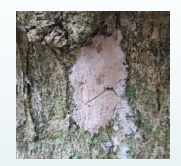
Eggs: October - June