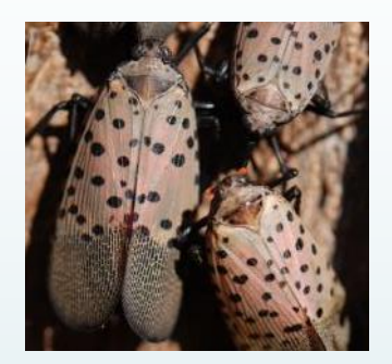
Adults: July - December