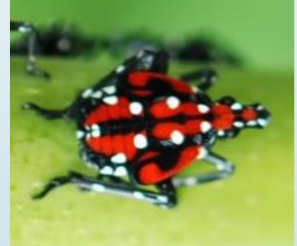
Fourth Instar: July - September