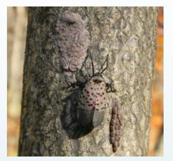
Egg Laying: September -November