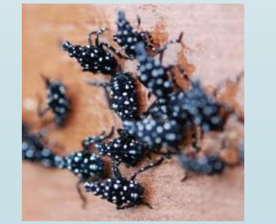
Hatch and 1st Instar: May - June