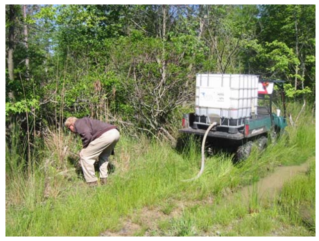
Submitted by: Tom Gallagher