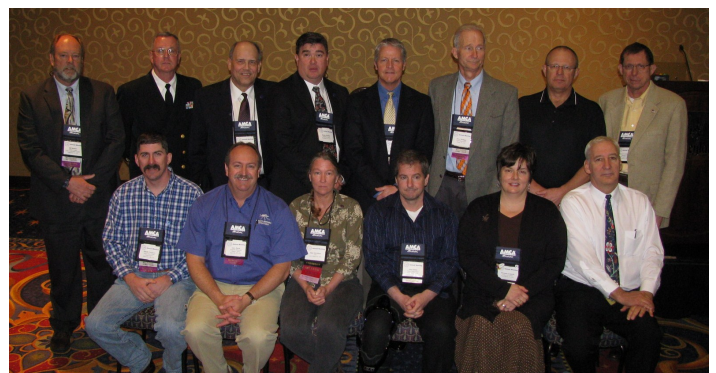
2011 American Mosquito Control Association Board of Directors, Anaheim, CA

Finally, next year's annual meeting is in Austin, Texas. Yeeee-haw!!! The dates are a bit earlier (February 26-March 1). More information is available on the AMCA website.