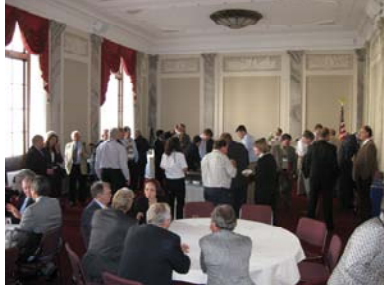
AMCA members, industry personnel, trustees and others mingle with Congressional staffers at a reception on Capitol Hill during AMCA's Washington Days 2009.