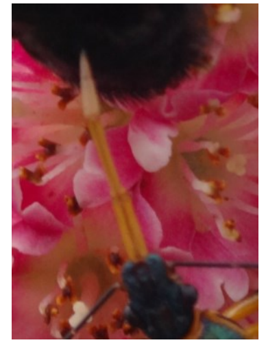
(answer on page 3)