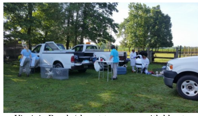
Virginia Beach (closest to camera with blue tshirts) and Chesapeake crews setting up to take blood samples of the sentinels.

Sentinel chickens are an essential part of these cities' programs. They are placed at various locations throughout each city and are used to identify presence of West Nile virus (WNV) and Eastern Equine Encephalitis virus (EEEV). After the initial baseline testing is done to confirm no presence of infection, blood samples are taken from the birds weekly or biweekly, depending on the city. The samples are sent to the Virginia Division of Consolidated Laboratory Services (DCLS) in Richmond where they are tested for antibodies to the two viruses previously mentioned. When a sentinel chicken is bitten by an infected mosquito, within a week the chicken begins to produce antibodies to the respective virus; they are not harmed. Once a blood test comes back as positive for antibodies for either virus, the chicken is replaced and the respective