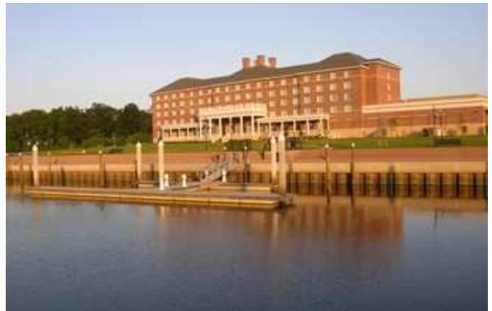
The Hilton Garden Inn

8:30 - 11:40 Presentations 11:40 Business Meeting & Door Prizes